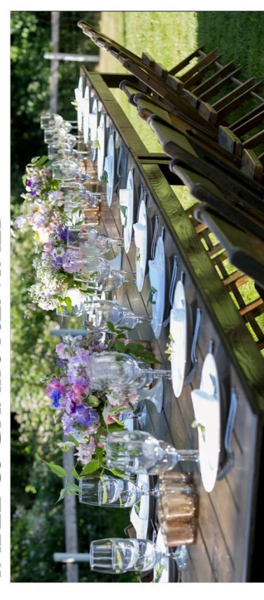
TABLE & CHAIR RENTALS